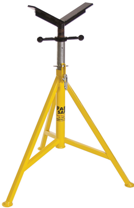
Fab Saf™ with V-head PART NO 4800