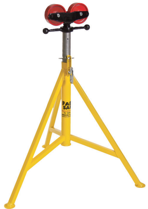
Fab Saf™ with steel wheel head PART NO 4800SWH